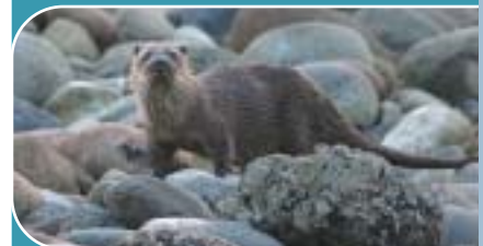
> Thirty years of salmon farming on South Uist has had little or no effect on otters.