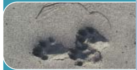
> Otters are shy and their presence is easiest assessed using tracks and sprainting sites.

use the habitat in exactly the same way as their forbears, there were just as many signs of otters in Loch Sheilavaig as there had been 23 years earlier.