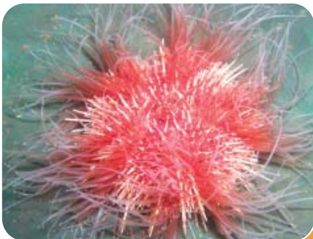
> The edible sea urchin, Echinus esculentus.