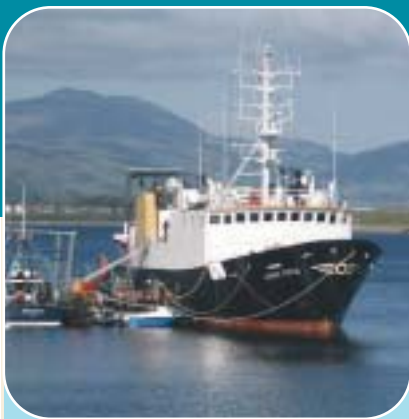
> The Lough Foyle docks at the Dunstaffnage pontoon.