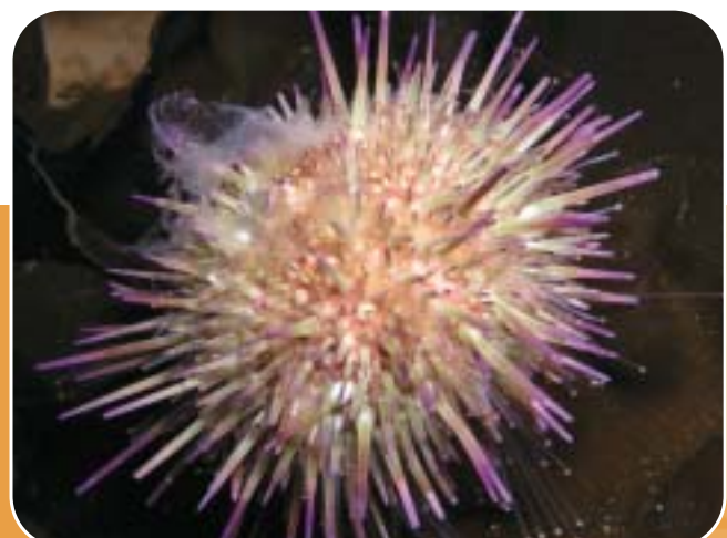
> The green sea urchin, Psammechinus miliaris .