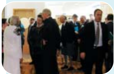
The Princess is introduced to some of the SAMS staff and visitors in the foyer – and later again in the café – of the new laboratory.