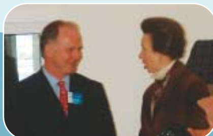
The Princess declares the new SAMS laboratory building open.