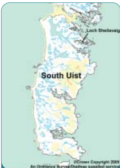
> Otters occur mostly on the rocky east coast of South Uist. (Map: S Gontarek)

Otters are native to the island, and their distribution and the use they make of the different aquatic habitats are fascinating as a transect from west to east across South Uist reveals.