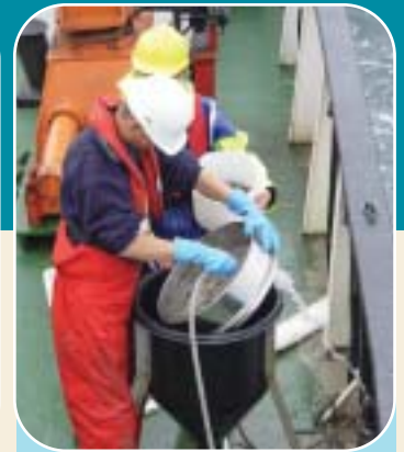
> Scientists are carefully sieving coral rubble samples before preserving them.

The last ten years have seen a large research effort focussed on cold-water corals around the world, and many new reef areas have been discovered. Particularly large and spectacular Lophelia reefs have been found on the Norwegian continental shelf, some growing to form chains kilometres in length. Sadly alongside these exciting discoveries, it has become clear that many of the reef areas have been damaged by fishing activities, especially bottom trawling.