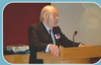
On the 25th anniversary of his reaching the North Pole, polar explorer Sir Wally Herbert dedicates the SAMS conference room to Scotland's most eminent polar scientist and explorer, William Speirs Bruce.